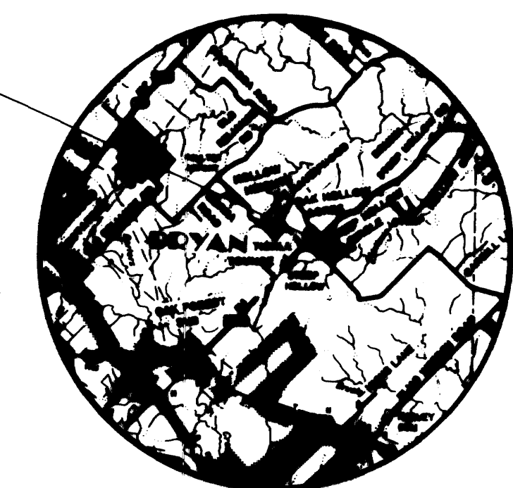
VICINITY MAP n.t.s.